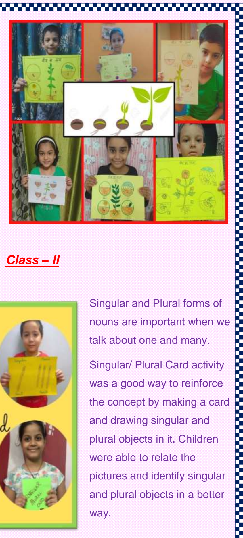
<u>Class – II</u>